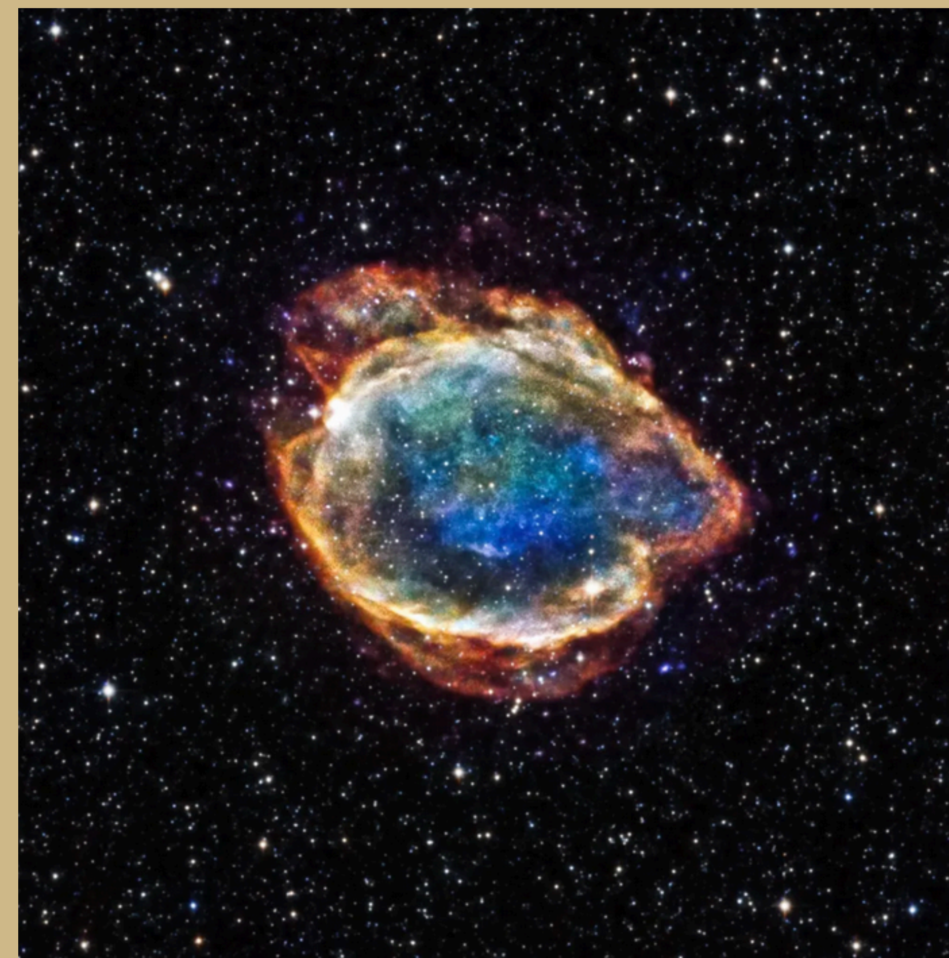
Fig 1. Type Ia Supernova Remnant 6299.